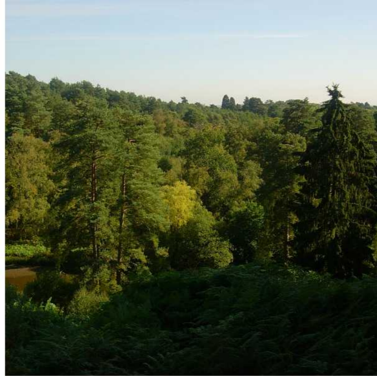
Above Heron Valley, Rushmere Country Park, Leighton Buzzard.